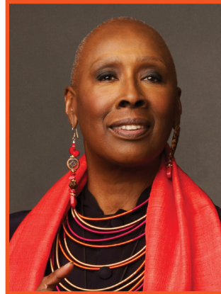
JUDITH JAMISON ARTISTIC DIRECTOR EMERITA